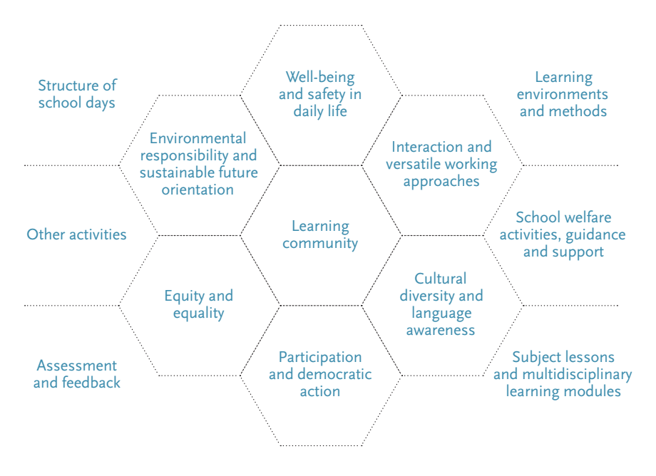
Figure 2: The main principles guiding the development of school culture in basic education in Finland

The main principles have the purpose of supporting the education providers and schools in directing and developing their activities. They should be actualised in the day to day work in the school.